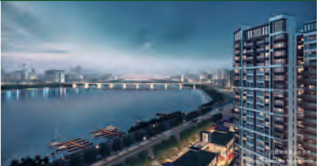
此乃藝術構圖以作參考 Artists impressions for reference